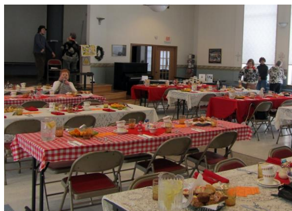
Brunch tables ready to go