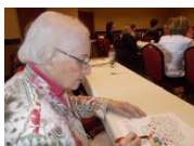
AAUW of Wisconsin Spring Convention Highlights - by Nancy L. Schulz

We were reminded that contributions to AAUW Funds are fully tax deductible. Also $45 (all but $4) of the National portion of our dues is tax deductible. Ours is a non-profit service organization.